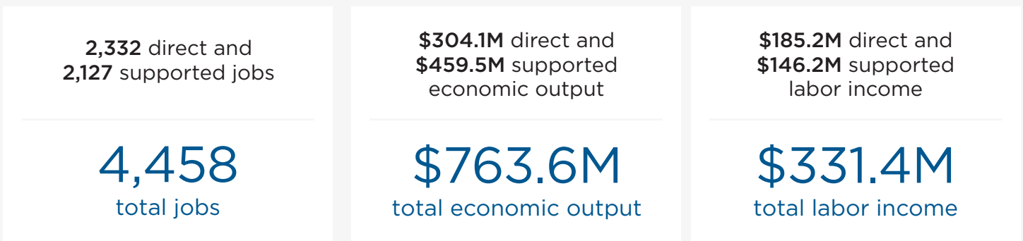
FIGURE 2. Economic Impact of Community Health Centers in Kansas

Note: Totals may differ from sum of numbers due to rounding.