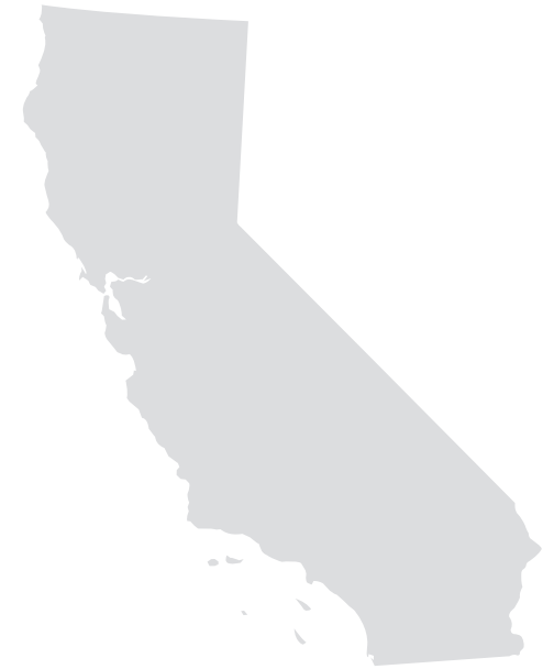
FIGURE 1. Otsuka's Economic and Fiscal Impact in California*

wages, and economic activity in the state. In 2022, Otsuka supported nearly 800 jobs, generated more than $116 million in labor income (a measure of wages), and contributed nearly $218 million in economic output in California. Otsuka's business activities in California also result in additional tax revenues. In 2022, state, local, and federal tax receipts attributable to or supported by Otsuka's economic activity in California are estimated at $38.2 million. 1 (See Figure 1.)