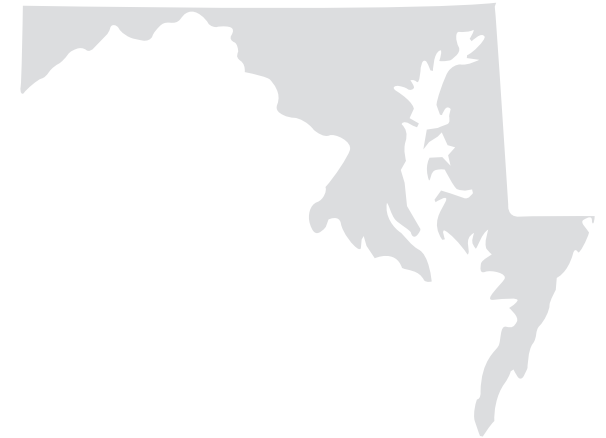
FIGURE 1. Otsuka's Economic and Fiscal Impact in Maryland*

and economic activity in the state. In 2022, Otsuka supported more than 900 jobs, generated nearly $155 million in labor income (a measure of wages), and contributed more than $291 million in economic output in Maryland. Otsuka's business activities in Maryland also result in additional tax revenues. In 2022, state, local, and federal tax receipts attributable to or supported by Otsuka's economic activity in Maryland are estimated at $45.7 million. 1 (See Figure 1.)