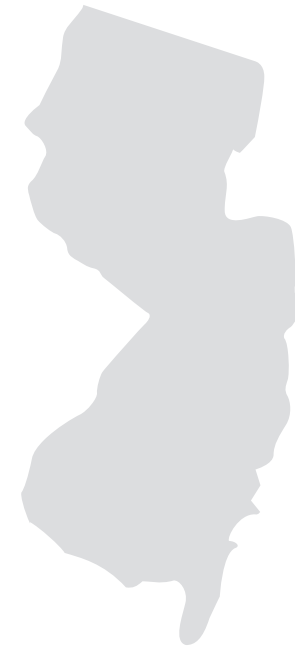
FIGURE 1. Otsuka's Economic and Fiscal Impact in New Jersey

wages, and economic activity in the state. In 2022, Otsuka supported more than 2,500 jobs, generated more than $400 million in labor income (a measure of wages), and contributed more than $728 million in economic output in New Jersey. Otsuka's business activities in New Jersey also result in additional tax revenues. In 2022, state, local, and federal tax receipts attributable to or supported by Otsuka's economic activity in New Jersey are estimated at $126.6 million. 1 (See Figure 1.)